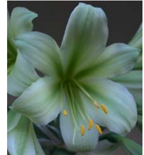
Charl Coetzee's 'Green One'